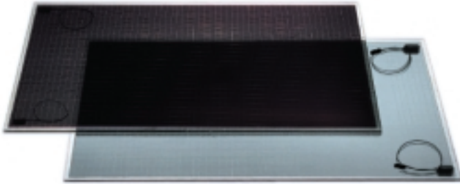
ASITHRU-30-SG semitransparent 36 V DC

Module type key: SG = laminated safety glass