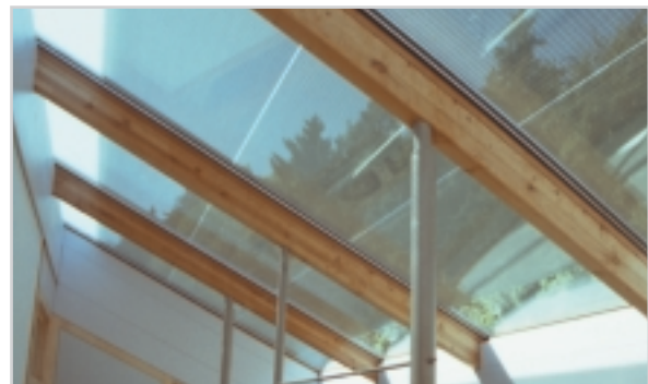
New solar architecture: brilliant, colorless transparency

The modules are factory equipped with plug connectors and can be connected quickly and safely in series. The specific characteristics of ASI THRU® solar modules eliminate the need for bypass diodes.